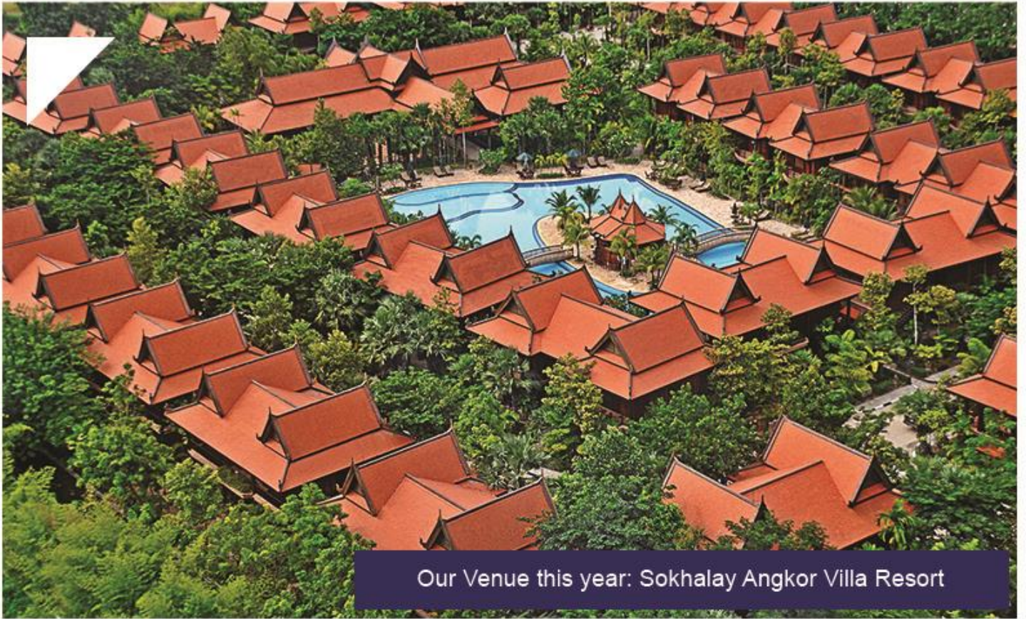
Our Venue this year: Sokhalay Angkor Villa Resort