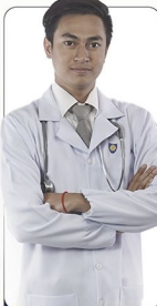
វេជ្ជសាស្ត្រ

The Official Newsletter of the University of Puthisastra (UP)