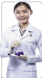
បច្ចេកទេសមន្ទីរពិសោធន៍