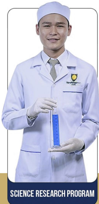
SCIENCE RESEARCH PROGRAM

The Official Newsletter of the University of Puthisastra (UP)