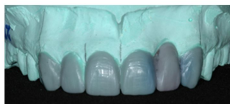
DIAGNOSTIC WAX UP FOR SILICONE INDEX